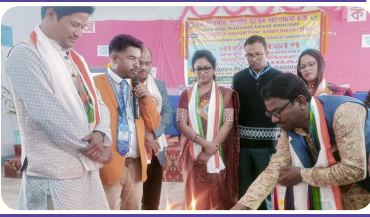
National Seminar, Dept. of Sanskrit