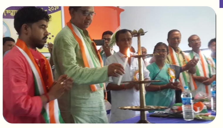
Thakur Panchanan Memorial Lecture